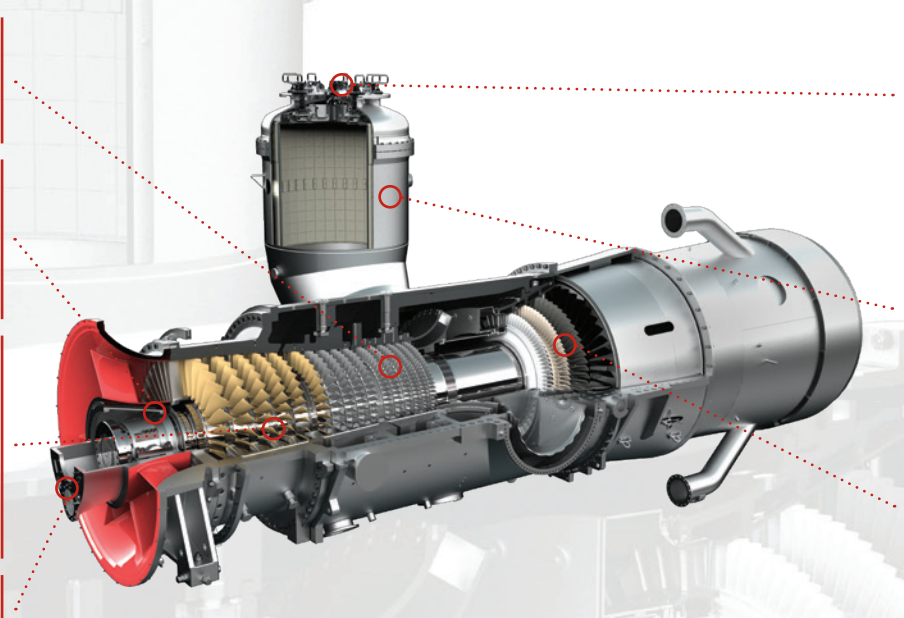
*All vanes and blades replaceable with rotor in place.

16 stages axial compressor with variable quide vane* Rotor Displacement System (RDS) for gap optimization Single shaft, internally aircooled rotor, disk type with Hirth serration and central tie rod Cold-end generator