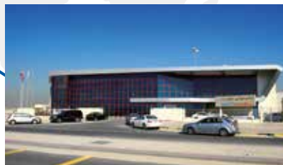
Ansaldo Thomassen Gulf Workshop Abu Dhabi, UAE

components ranging from gas turbine hot gas path components including blades, vanes and heat shields, to combustion components, rotors, fuel nozzles, generators and steam turbines, all with the reassurance of quality standards that a customer would expect from a Global OEM.