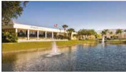
Power Systems Mfg., LLC Product Center 60Hz & E & F Class Workshop Jupiter, Florida/US