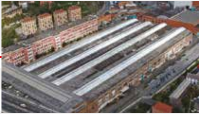
Ansaldo Energia Product Center 50Hz E, F-Class Workshop Genova, Italy