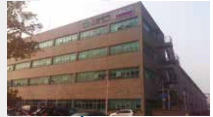
Ansaldo Gas Turbine Workshop Shanghai, China