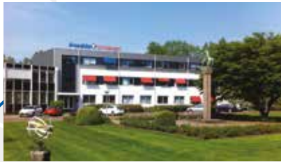
Ansaldo Thomassen Product Center 50Hz B, E Class Workshop Rheden, Netherlands