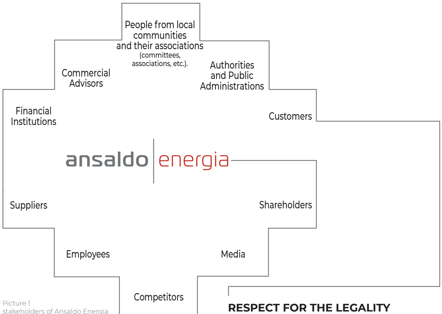
Picture 1 stakeholders of Ansaldo Energia