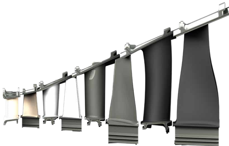
MXL2 blade and vanes